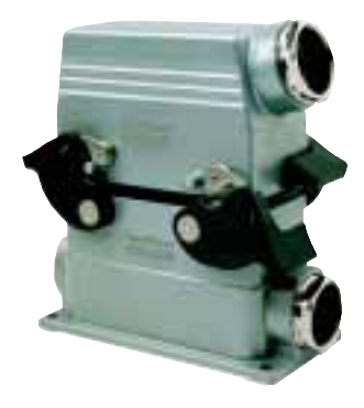
Easy handling Owing to divided double locking levers. For dead-easy operation.