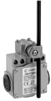
F7 - Adjustable Ø 6 rod lever