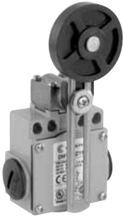
F52 - Adjustable Ø 50 rubber roller lever