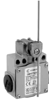
F7 - Adjustable rod lever

F71: stainless steel rod Ø3 F72: fiberglass rod Ø3 F75: square steel rod 3x3