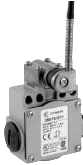
F61 - Nylon actuator with stainless steel spring