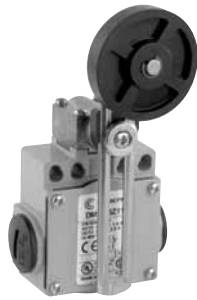
F55 - Adjustable lever with adjustable Ø 50 rubber roller